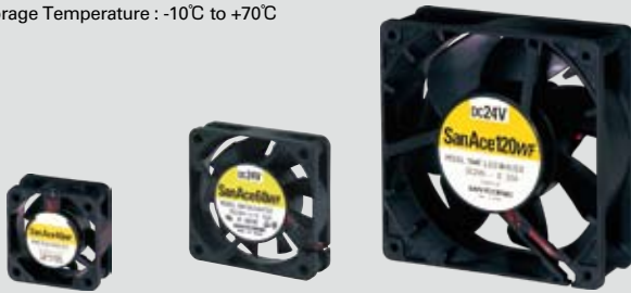
□40mm 20mm thickness □60mm 15mm thickness □120mm 38mm thickness

Life expectancy : 40,000 hour Storage Temperature : -10°C to +70°C